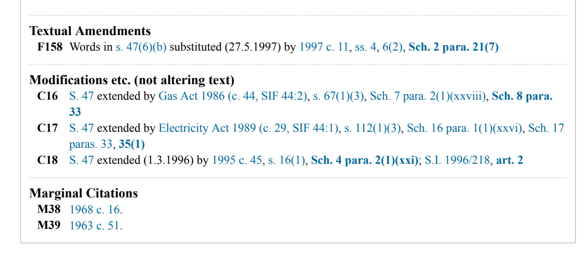
Advance payment of compensation

and includes such development which has already been carried out when the direction in respect of it is given as well as such development which is then proposed.