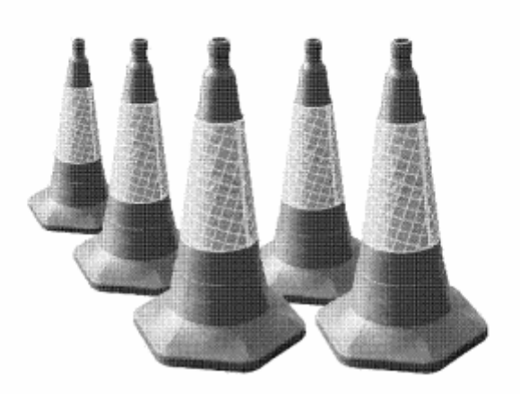
Traffic Management Act 2004 Approved Version