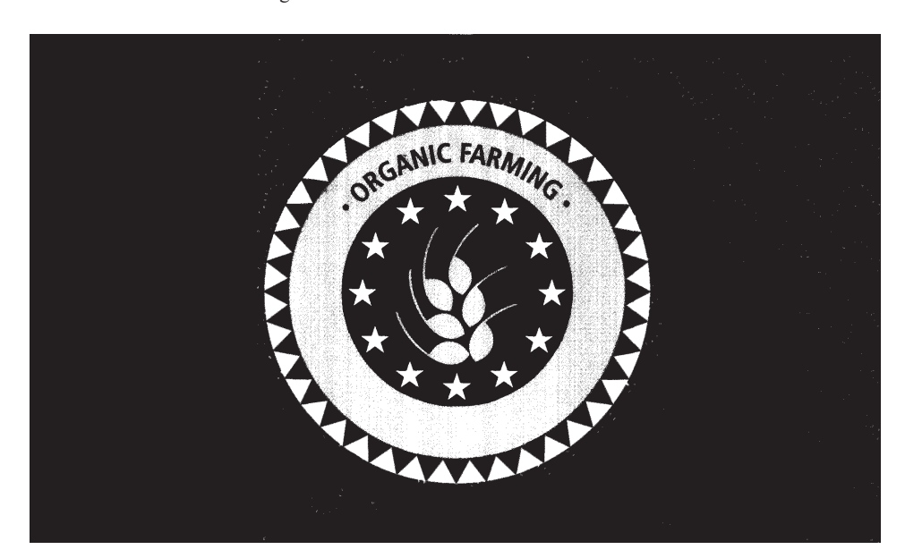
LOGO IN COLOURED BACKGROUND

If the logo is used in colour on coloured backgrounds which makes it difficult to read, use a delimiting outer circle around the logo to improve its contrast with the background colours as shown: