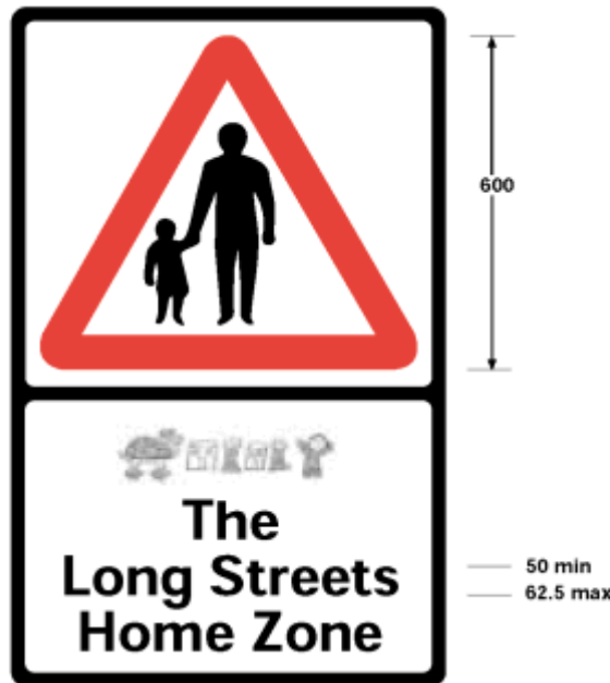
544.1A Traffic calmed area

(4) In Schedule 1 (warning signs) after diagram 544.1 there shall be inserted the following diagram and the words specified in and under it –