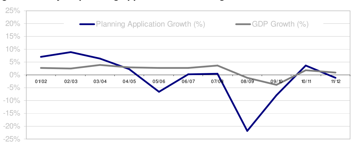
Figure 3: Ten year planning application and GDP growth rates

Assumptions around take up are set out clearly with the costs and benefits for each option. An annual summary table for the central scenario for the costs and benefits of the options described below can be found at Annex A. Once again, this treatment is consistent with the methodology used in the Impact Assessment for New opportunities for sustainable development and growth through the reuse of existing buildings (DCLG12029) previously validated by the Regulatory Policy Committee.