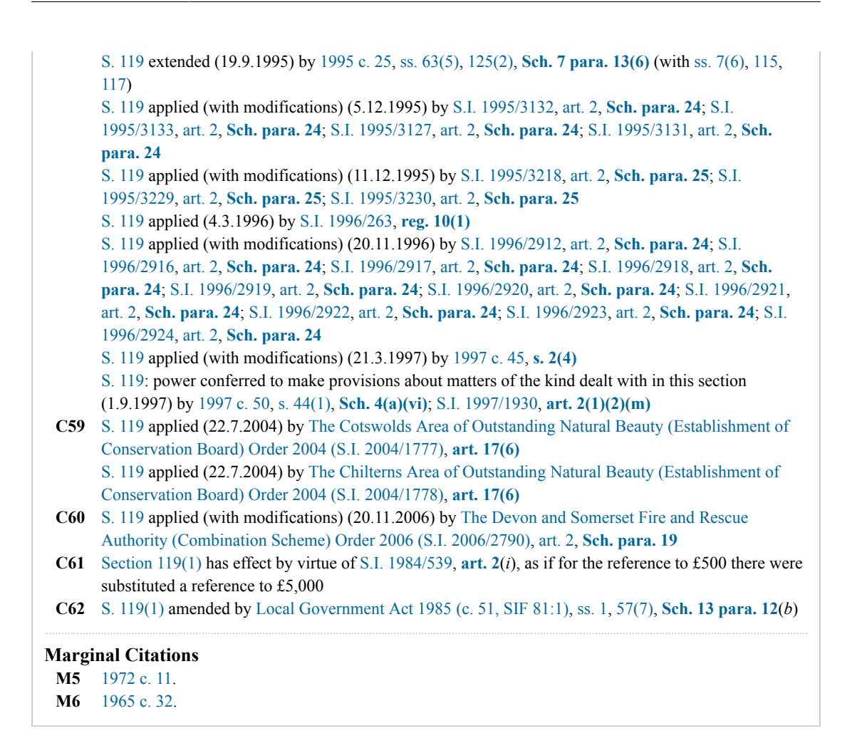
Land transactions — principal councils