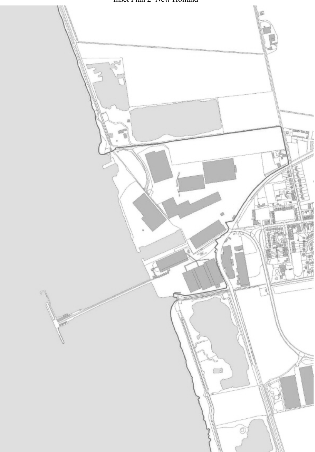
Inset Plan 2-New Holland